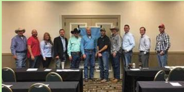
2017 Chapter Leadership